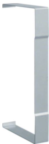
Capac BRS100210B, otel, galvanizat