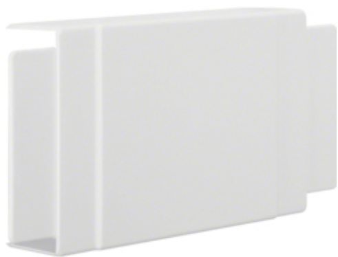
Derivatie T LFF40110, RAL9010